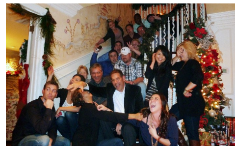
Happy New Year & Seasons Greetings from all of us at TRI!