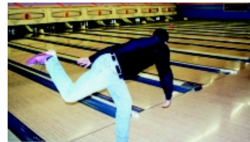
TR's "unique" bowling style at TRInternational's annual Christmas bowling tournament