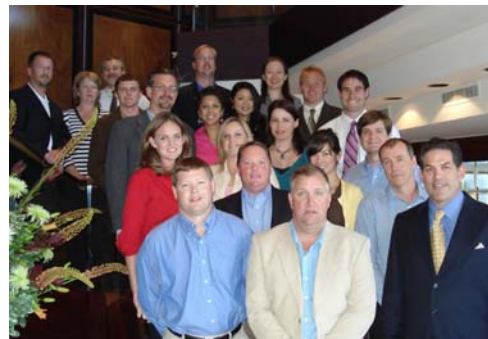
TRI at the Columbia Tower, Seattle, WA